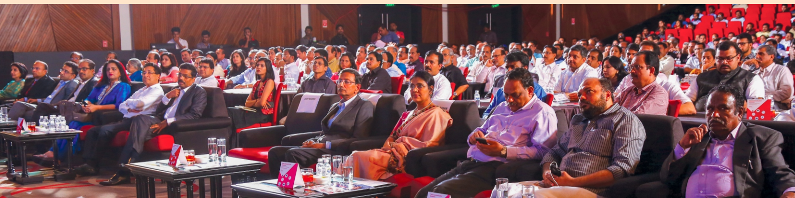
▲ A view of the audience at the Dhanam Business Summit